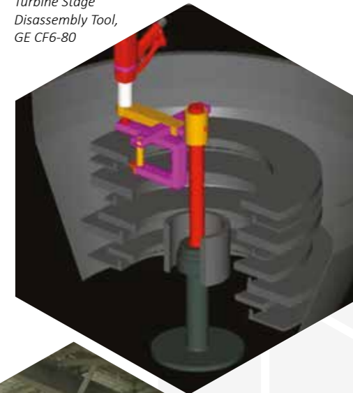
Turbine Stage Disassembly Tool, GE CF6-80