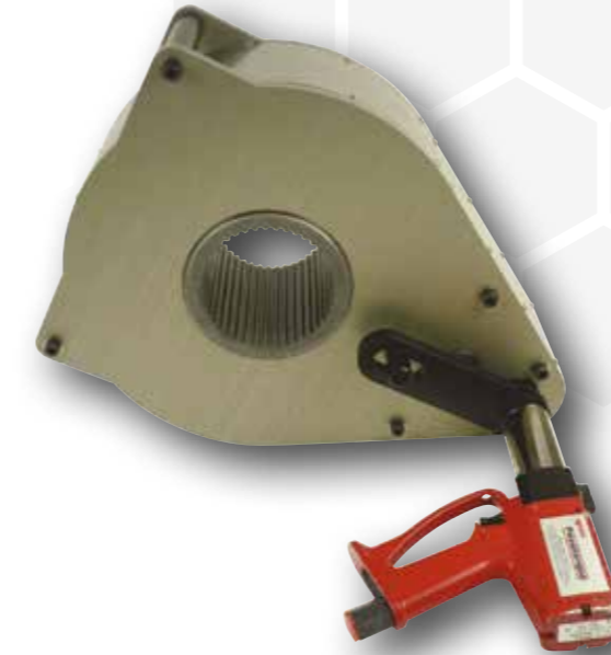
Number 3 Bearing Lock Nut Tool, GE CF6-80 engine