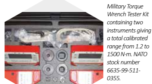
Military Torque Wrench Tester Kit containing two instruments giving a total calibrated range from 1.2 to 1500 N-m. NATO stock number 6635-99-511-0355.

The ultimate accolade for the USM was that after over one year of testing against competitive instruments at NASA's Stennis Space Center, it was selected to replace the aging fleet of instruments which had been used on over 40 safety critical applications on the Space Shuttle Main Engines (SSME). Norbar's USM instrument have been selected for use on ultra-critical applications found on the Space Shuttle, expendable launch vehicles and satellites. These include: Delta 4 Launch Vehicles; SSME High Pressure LOX & Fuel Turbopumps, Main Combustion Chamber to Powerhead and HP Ducting; likewise, USM-3 was used for the Hardpoint bolts, Keel bolts and Trunnion bolts on the Spacelab Logistics Pallet (SLP) used for payload mounting on such missions as STS-123 (Dextre Robotics for ISS) and STS-125 (Hubble Space Telescope Servicing Mission 4).