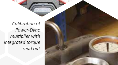
Calibration of Power-Dyne multiplier with integrated torque read out