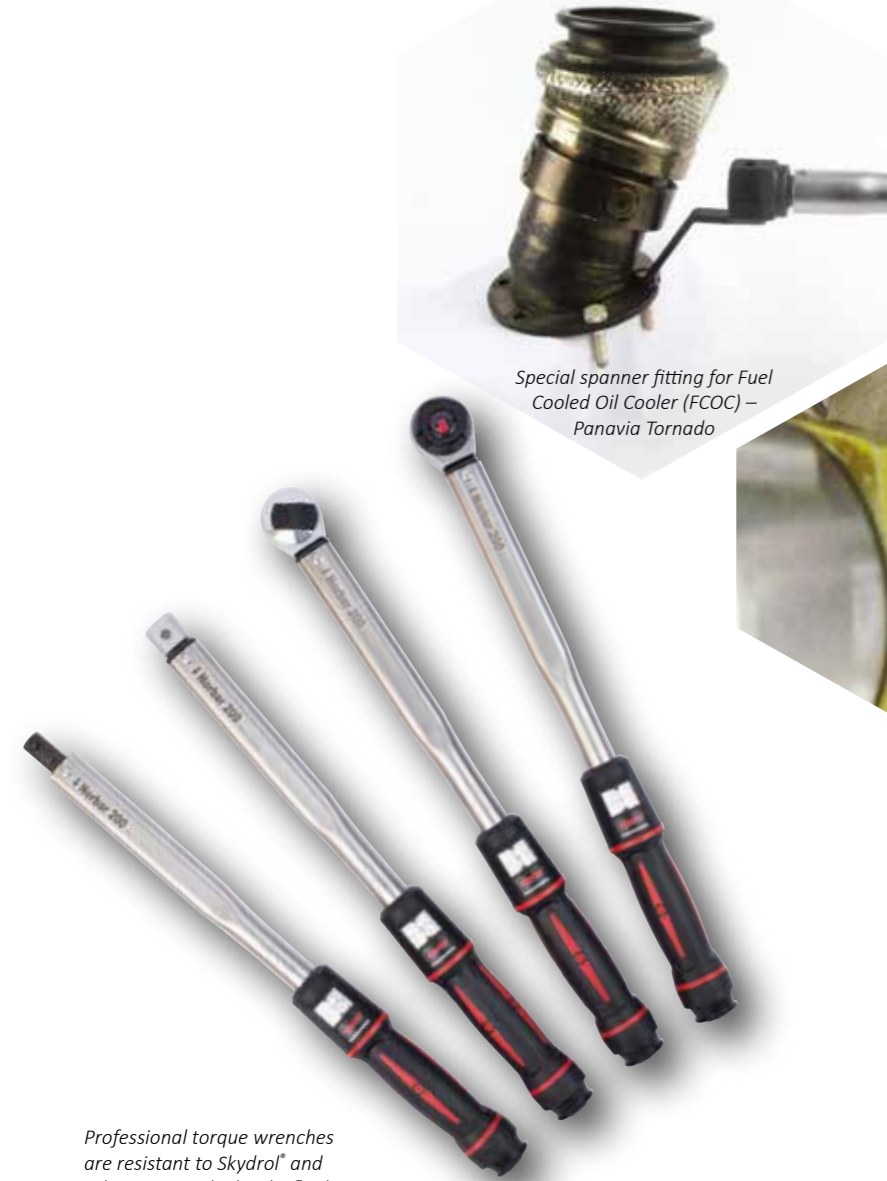
Professional torque wrenches are resistant to Skydrol® and other aviation hydraulic fluids

Many aircraft fasteners are impossible to reach with standard tools and there has been an example of aircraft loss due to the simple reason that a fastener could not be reached and was therefore never tightened correctly. Norbar offer an Engineer to Order (ETO) service to manufacture special fittings to reach these fasteners.