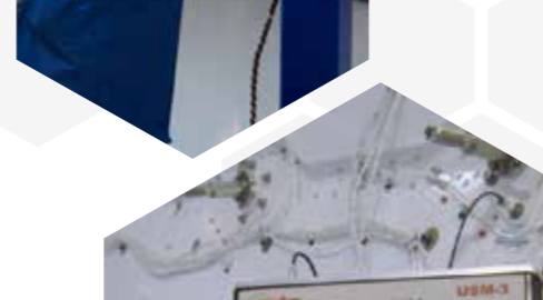
USM-3 Measurement of Spacelab Logistic Pallet hardpoint bolts used on STS-123 at Kennedy Space Center